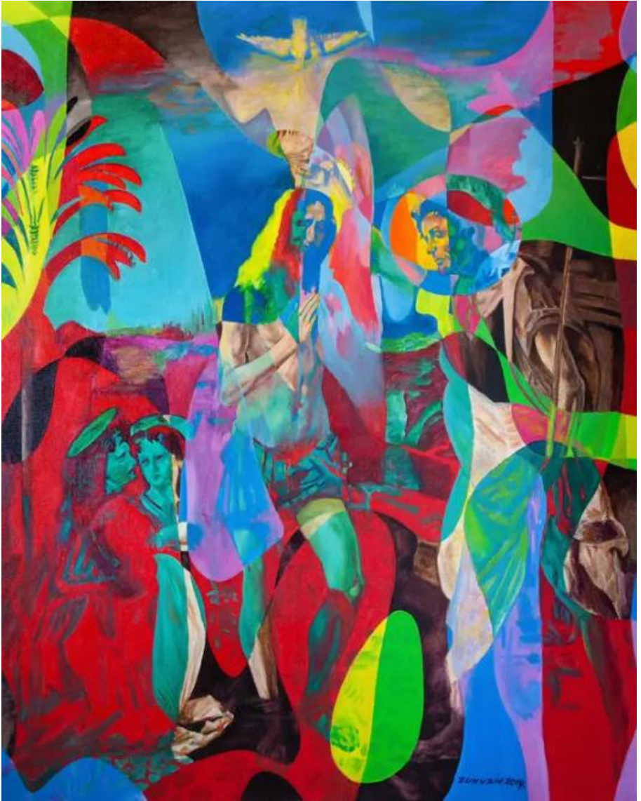
The Baptism of Christ by Vladimir Zunuzin